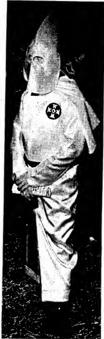
Robed in satin